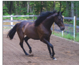
Superhappycombo was scheduled to be sold to slaughter. He has been adopted into a permanent home.

The Exceller Fund also assists other organizations with their rescue, rehabilitation, adoption, and retirement efforts. We collaborate with other groups when the need is great.