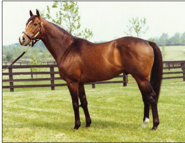
Exceller

E xceller was a Champion of the 1970's racing era. Trained by legendary Charlie Whittingham and ridden by none other than Bill Shoemaker, Exceller competed and won at the top levels in racing.