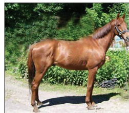
Precision Winner Despite racing 138 times, this 9-year old gelding had no future until The Exceller Fund secured him.

Join The Exceller Fund! Membership is available for as low as $15 per month. Members receive updates on the horses and activities of The Exceller Fund and get to feel like a part of a community that owns many horses. If you feel membership is not for you, one-time donations are always appreciated and needed.