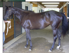
Clockwise from top left: Upon The Roof, Sully's Silver, Missy Won, Top Encounter. Center: Spectacular Won.